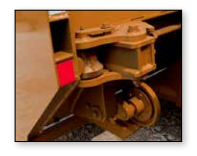
Corrugated Sidewall, Adjustable & Greasable Rollers