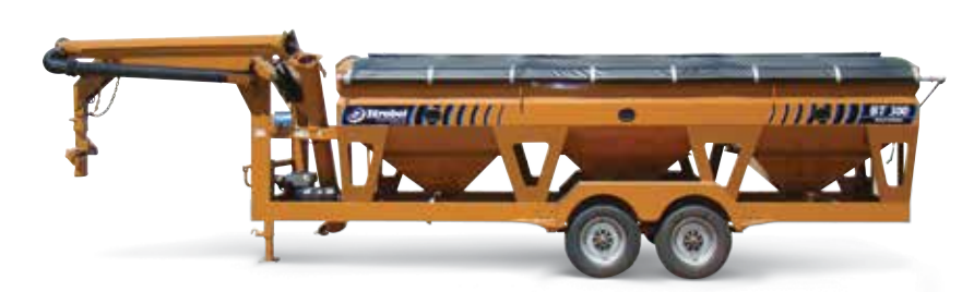
BT 300 Bulk Seed Tender