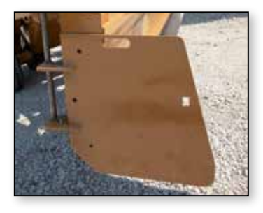
Fold-Away, Storable Doors Convert to Box Scraper