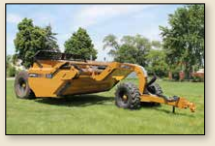
FE 1200 Dolly Hitch

Guide Rollers: Adjustable 3" greasable concave rollers