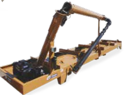
4 Box Seed Tender Skid