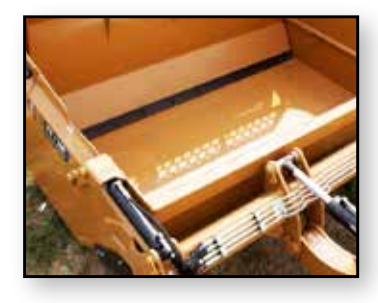
Adjustable Cleanout Blade