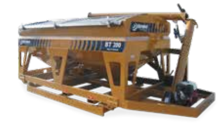
BT 200 Bulk Seed Tender Skid