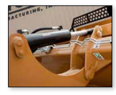
Anti-Rotational Pins & Cross Tube Cylinders