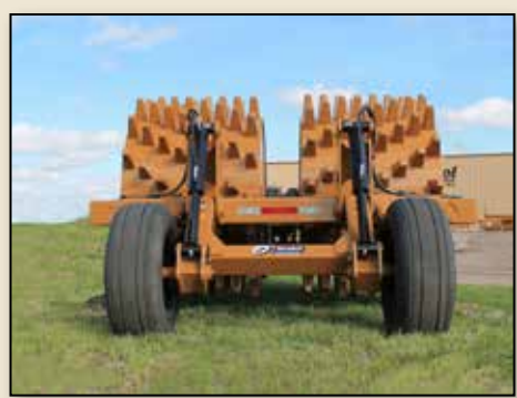
Hydraulic Lock for Transport