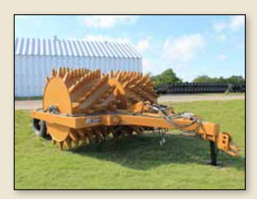
Double Drum Model