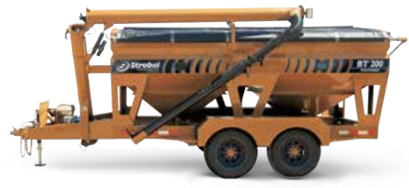
BT 200 Bulk Seed Tender