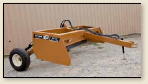
MEDIUM DUTY (MD)