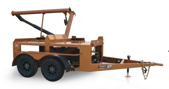
2 Box Standard Seed Tender