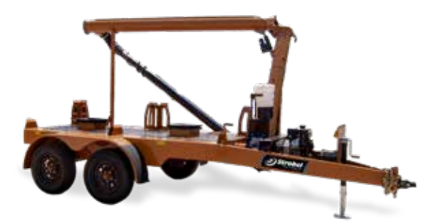
2 Box Lo-Profile Seed Tender