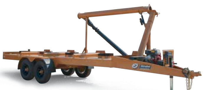
4 Box Lo-Profile Seed Tender